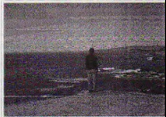
A view from Bodega Head.